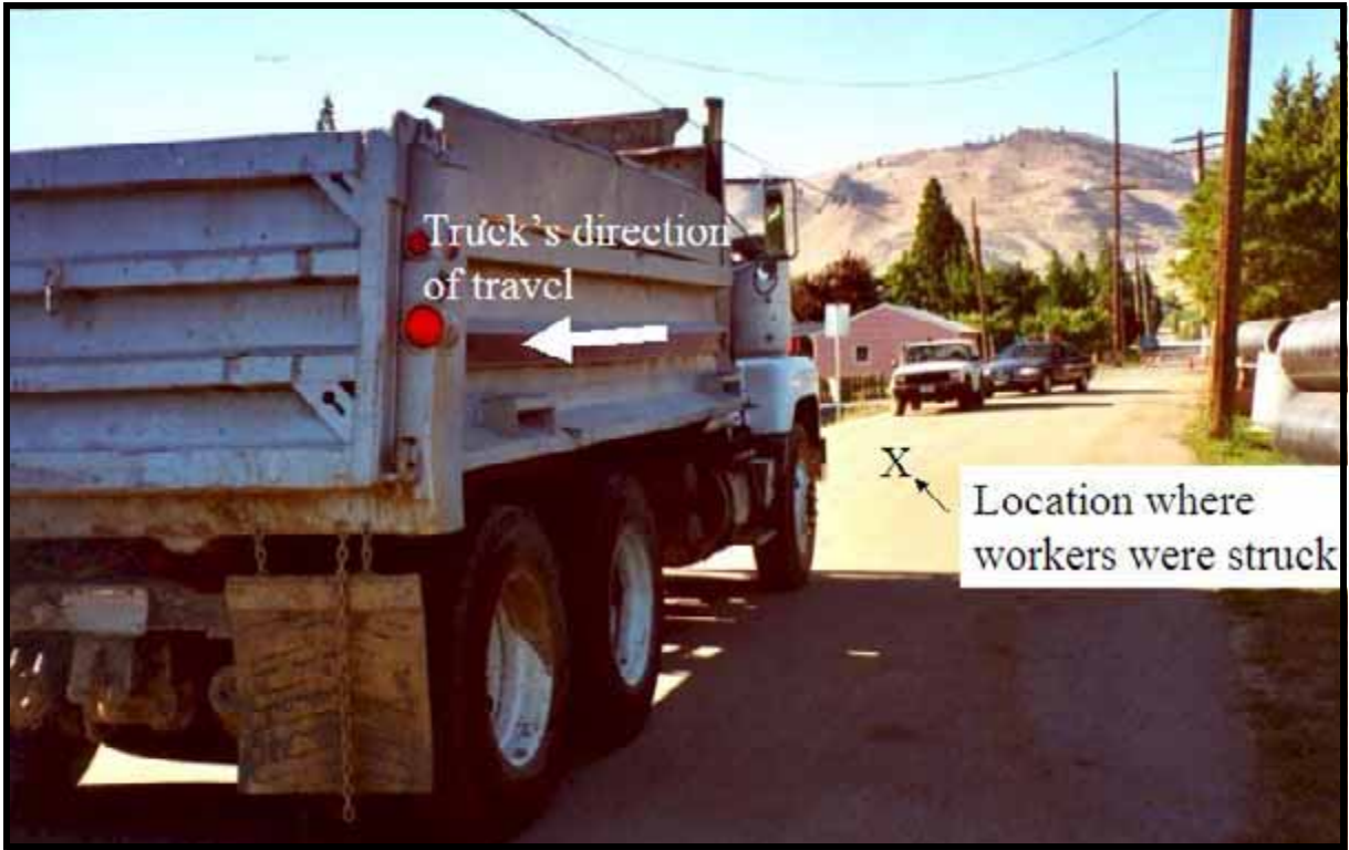
Photo 2 Incident site and dump truck.