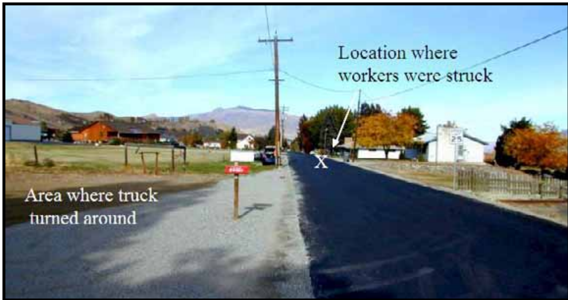
Photo 1 Incident site after completion of the job.