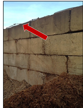
Photo 3. Steel cable threaded through ecology block picking eyes at top of wall

After the incident, the employer developed a detailed safety program and standard operating procedures that address hazards in both construction of and working near ecology block walls. The safety training component of the program uses a three-tiered approach based on how much exposure an employee will have to ecology block hazards depending on their work duties. Employees are categorized as either “Certified,” “Authorized,” or “Affected.” All employees are considered Affected workers and receive training regarding the hazards associated with working around ecology block walls as a component of new-hire training. Authorized employees receive more detailed training how to safely construct ecology block walls and are permitted to work on projects building or re-building walls. The training includes how to recognize hazards and the steps that employees should take to report concerns.