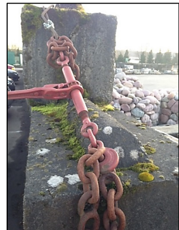
Photo 4. Ratchet mechanism for tightening wall cable

The company’s program also includes standard procedures for increasing the stability of walls when necessary, including doubling walls and binding blocks together using steel cabling anchored or bolted to the blocks (photos 3-5). Cabling was used frequently before the incident, as well.