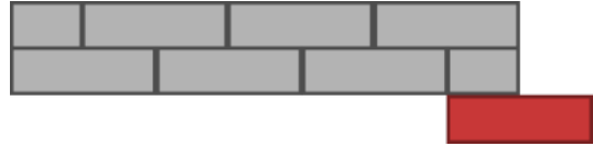
Figure 2. Placement of block (in red) immediately preceding wall collapse

As the block was set down on the sand against the base of the first section (figure 2), the walls became unstable and began to collapse. The victim and workers ran to try to avoid the falling blocks. Witnesses reported that, at some point, as he was running, the victim paused for a moment to look behind him, and then began running again. Before he was able to get clear, one of the blocks that had been on the top of the wall struck him from behind and landed on him, crushing his right leg and pinning him against the ground. Both of the other workers were able to escape uninjured.