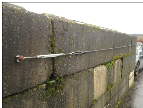
Photo 5. Steel cable bolted into side of ecology block wall

In addition, every six months, a safety audit of all existing ecology block walls is performed by two Certified employees to check for damage, material leakage, strained cables, or structural instability. If necessary, walls are disassembled and rebuilt.