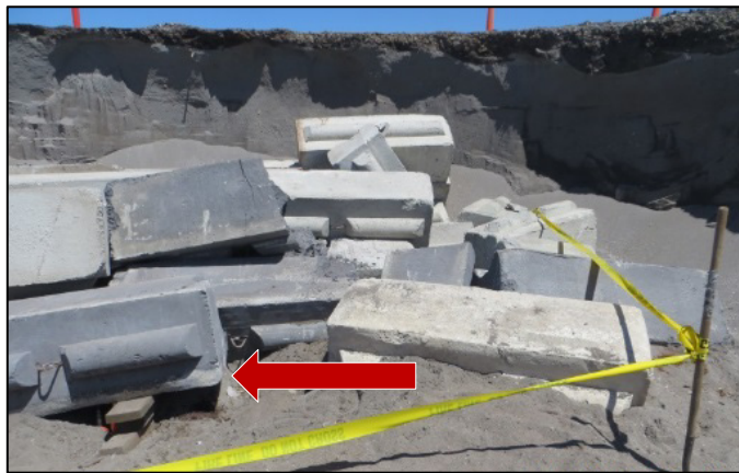
Photo 2. Collapsed ecology block wall. Arrow indicates block that struck victim

First responders arrived on the scene within minutes and were able to free the victim. He was transported by helicopter to a regional trauma facility. He underwent numerous surgeries, including the amputation of his right leg, and remained in intensive care until he passed away nearly one month later due to complications from the injury.