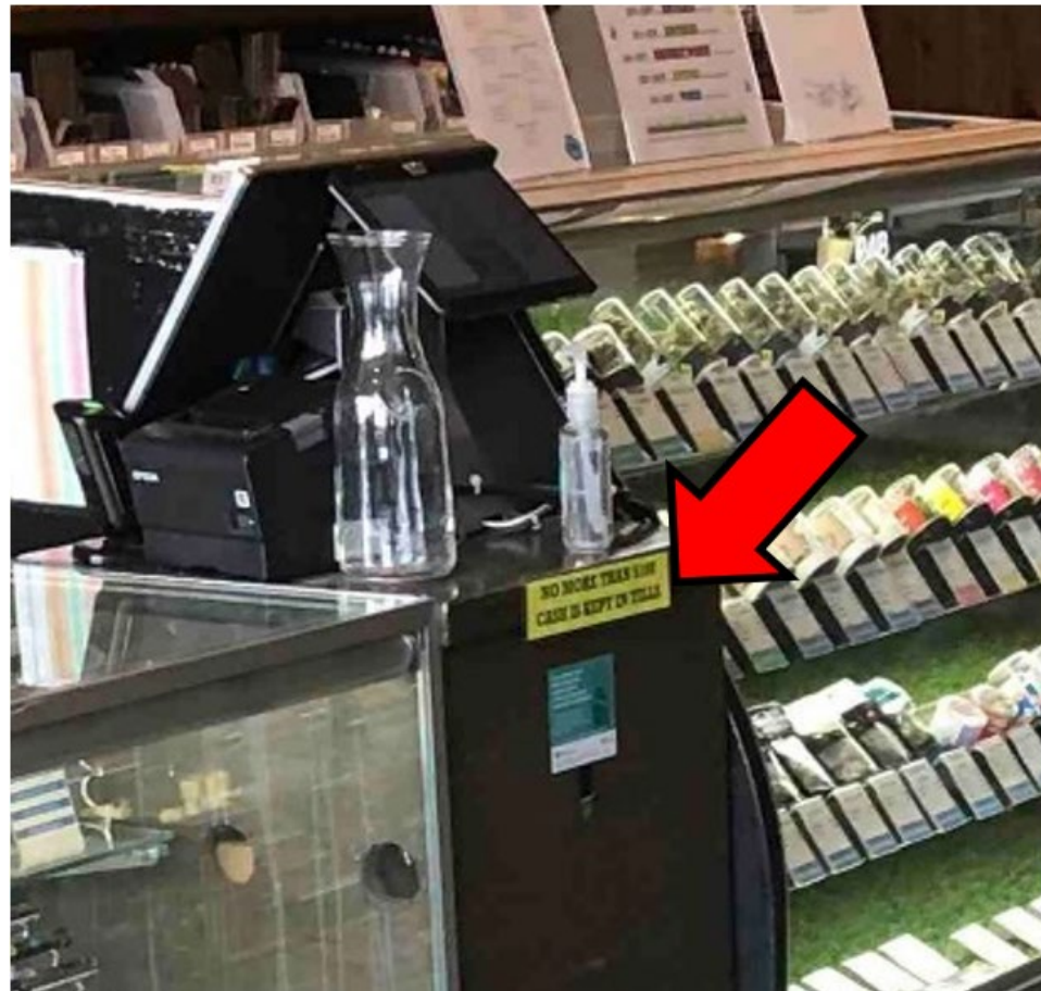
Photo 3. Arrow shows yellow sticker below cash register that reads “No More than $100 is Kept in Tills.” The employer applied the sticker in the days after the incident to help prevent a reoccurrence.