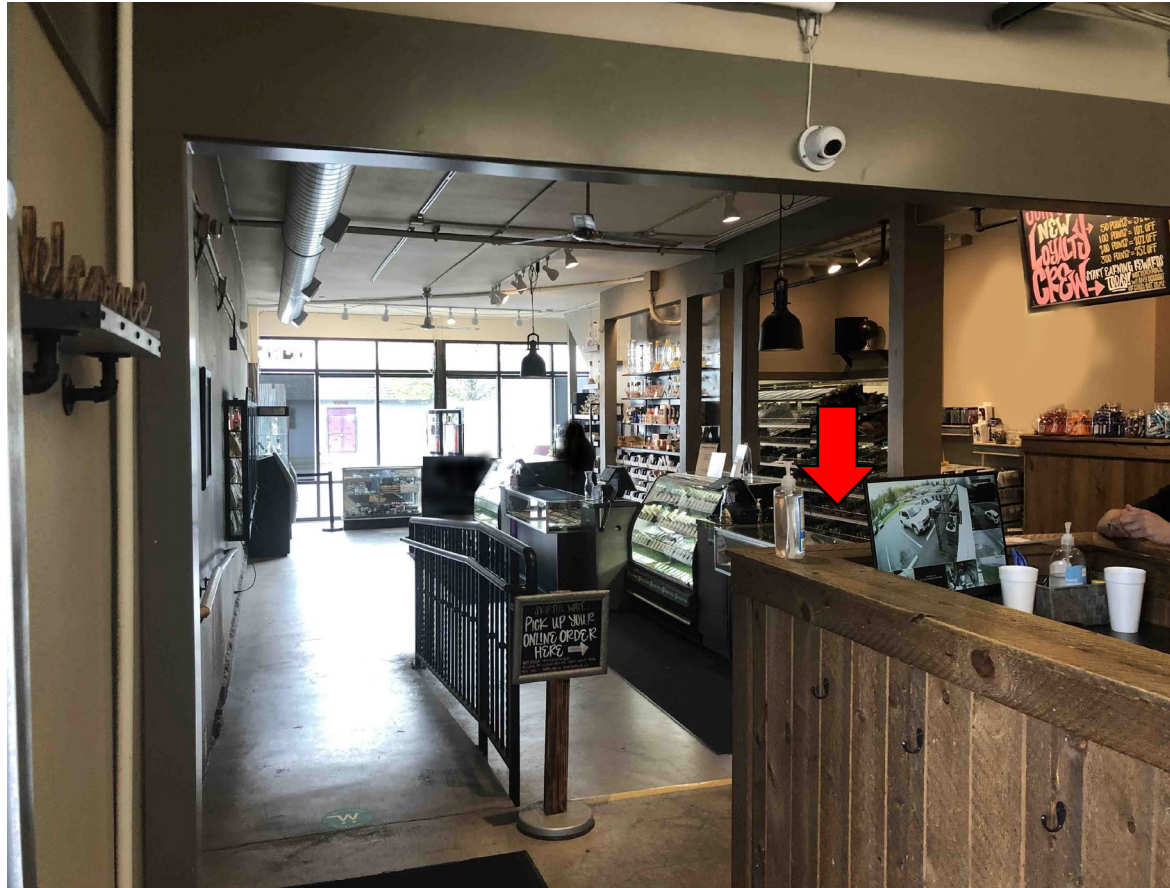
Photo 2. Interior view of cannabis store from entrance. Arrow points to area behind cash register counter where the worker was shot.