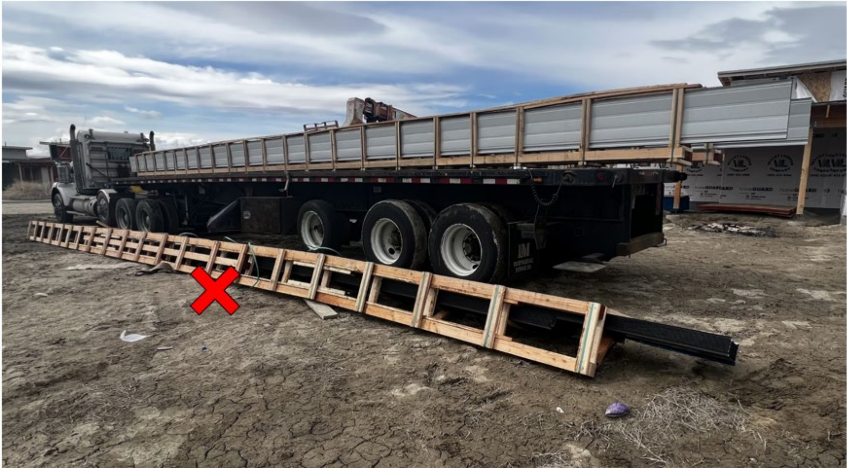
Photo 1. Location (x) where truck driver was crushed by crate that was pushed off the trailer by a forklift on the other side.