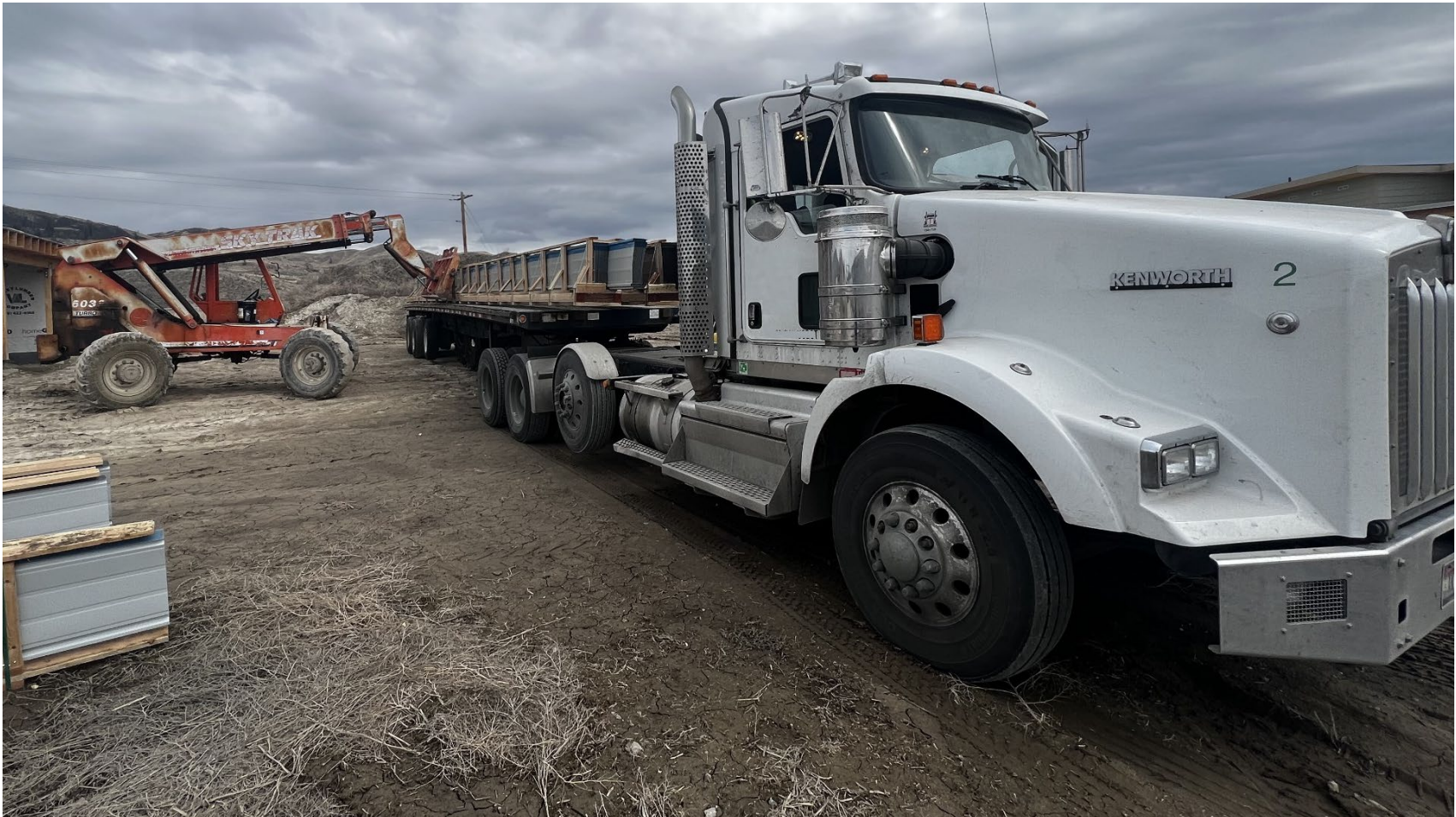
Photo 4. Telehandler forklift on passenger side of flatbed trailer. The truck driver was in the blind zone on the opposite side of the trailer when the crate was pushed off.