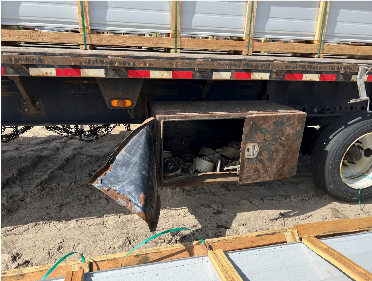
Photo 3. Damage to trailer's underbody toolbox caused by crate that crushed driver.