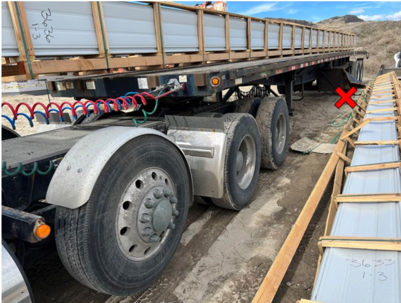
Photo 2. View of incident area from back of truck cab.