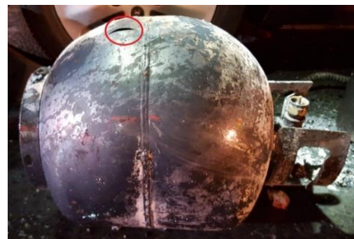
Photo 4: Incident 20-lb. propane cylinder as found inside the stand. A cylinder breach crack was caused by the fire (circled).