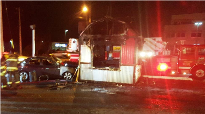
Photo 1: The coffee stand after fire department personnel had extinguished the fire.