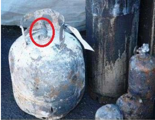
Photo 5: Incident 20 lb. propane cylinder with threaded adapter attachment in valve orifice.