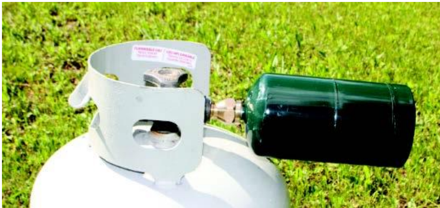
Photo 7: Non-reusable DOT 39 propane cylinder on the right attached by an adapter to a larger propane cylinder. This configuration is similar to that of the incident cylinders and adapter.