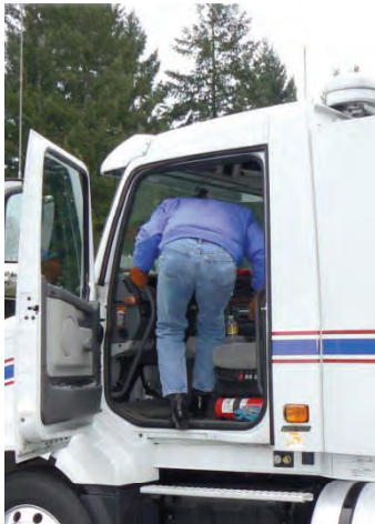
Using three points of contact