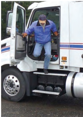
Jumping from cab

Below is an example of the results produced during the demonstration of the forces involved in exiting a truck cab.