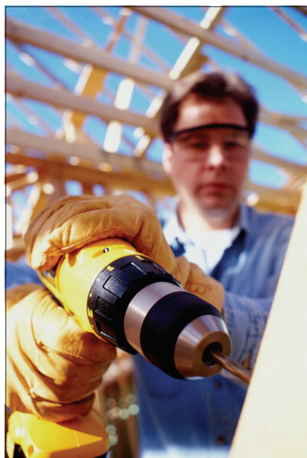
Power tool use wearing PPE

Lumber and tools can fall from elevated surfaces or due to poor storage. Or employees can be struck when materials are being moved.