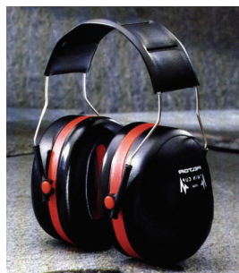
Some hearing protection options