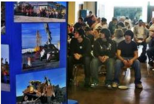
North Thurston High School students – learning about construction careers at a “Pizza and Power Tools” event

For more information on apprenticeship programs contact: Washington State Building and Construction Trades Council at (360) 357-6778 www.wabuildingtrades.org and available to view from the website - newly released “Apprenticeship Opportunities” video.