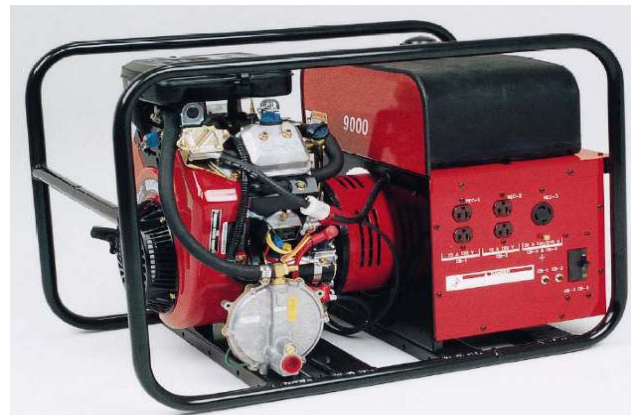
Portable Optional Standby Generator