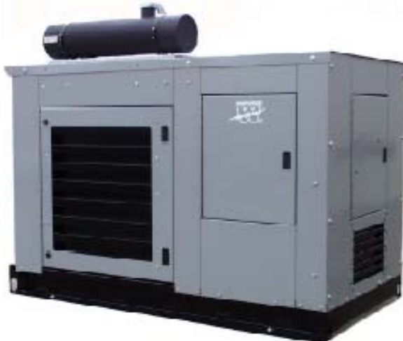
Stationary Optional Standby Generator

There are many types and sizes of back-up generators, and many variables to consider when installing your back-up generator system. Each size and type of back-up generator has different wiring connection requirements.