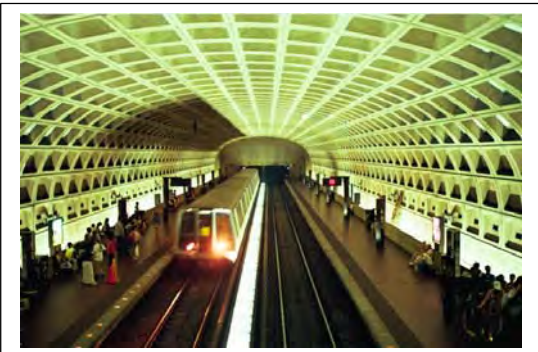
When it comes to track safety, cutting corners has lead to tragic deaths. Find and share real-life accounts of track incidents with workers at crew meetings.

Visit Lni.wa.gov/Safety/TrainingPrevention to find resources to help you train your employees