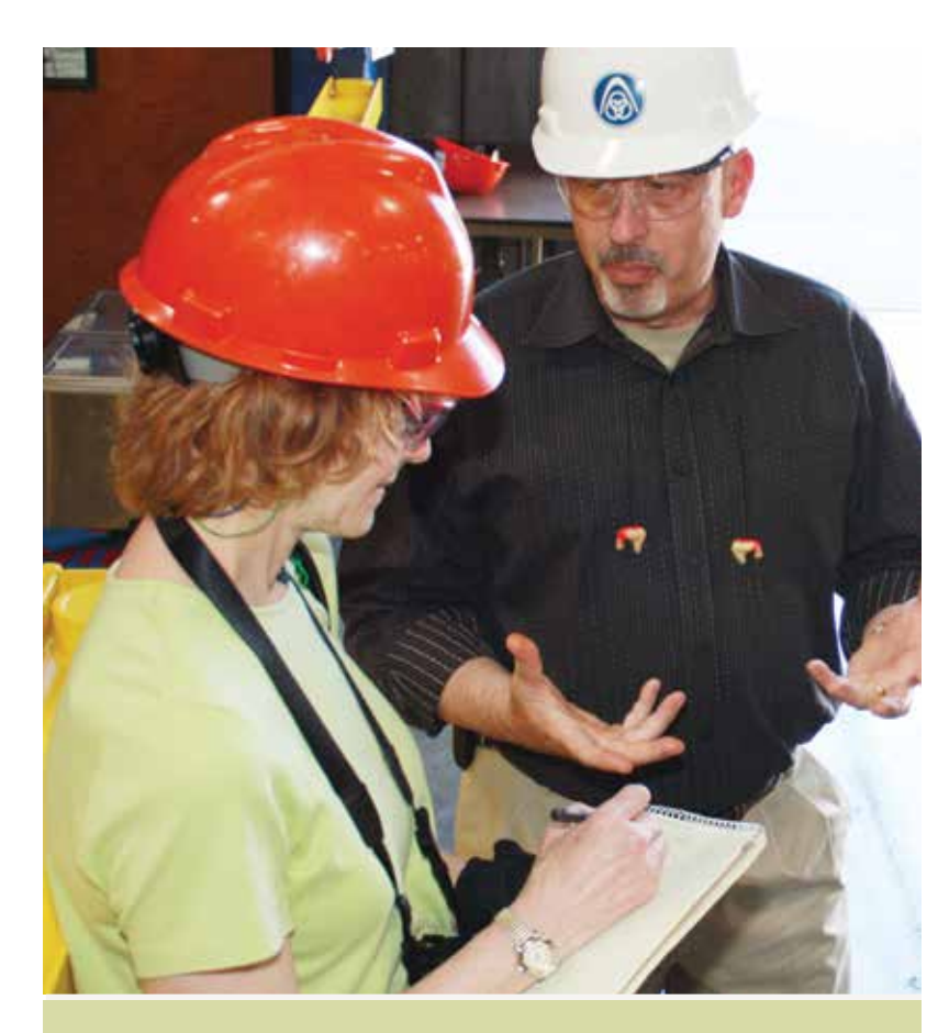
We offer many services to help you protect your employees and comply with workplace safety and health rules.