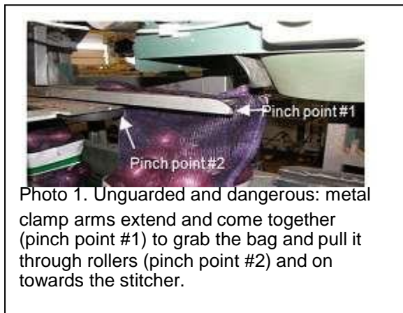
Photo 1. Unguarded and dangerous: metal clamp arms extend and come together (pinch point #1) to grab the bag and pull it through rollers (pinch point #2) and on towards the stitcher.

Each employee had their fingers caught and injured by a retracting metal clamp which grabs the top of bags after filling and pulls them through a set of rollers toward a stitcher. (see photos).