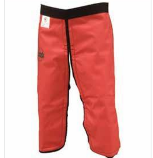
Photo shows approved chaps with ASTM tag.