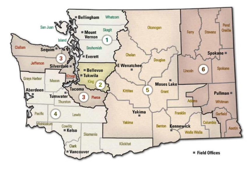
Figure 2. Map of the Six L&I Geographic Regions and Location of Field Offices

DOSH is staffed by an L&I assistant director, a statewide compliance manager, and eight regional compliance managers. Regional offices cover distinct geographic areas (see Figure 2) in the state and employ IH CSHOs. More information on enforcement in Washington can be found on the Washington State Plan website at www.osha.gov/dcsp/osp/stateprogs/washington.html