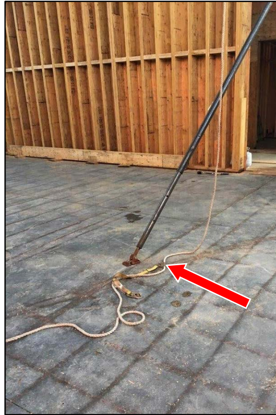
Photo 2. Incident location with the rope grab (arrow) showing slack in the lifeline.