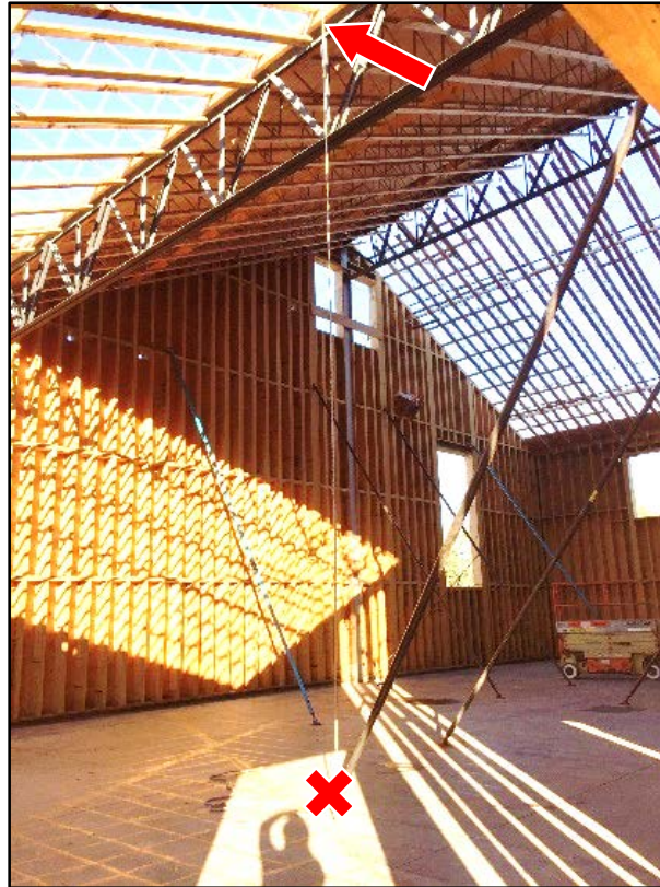
Photo 1. Location where the carpenter fell from the 8/12 pitch roof deck (arrow). The “X” indicates where he landed on the floor.