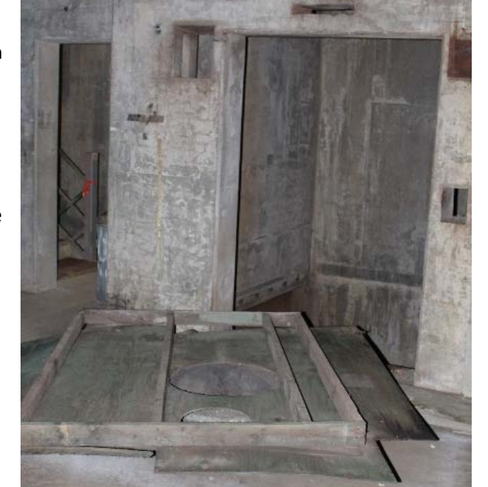
Elevator shaft where grip fell with wooden guard on the floor that used to cover shaft opening.

SHARP Publication # 52-50-2021_summary. The full version of this investigation report, along with the detailed recommendations and discussions section, can be found at: http://www.lni.wa.gov/safety-health/safetyresearch/files/2021/52 50 2021 MediaGripFall.pdf