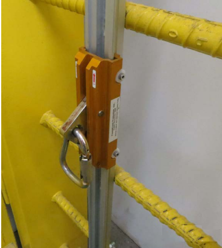
Photo 4. Ladder safety system consisting of a climbing trolley with tie off point attached to a track mounted to the ladder.