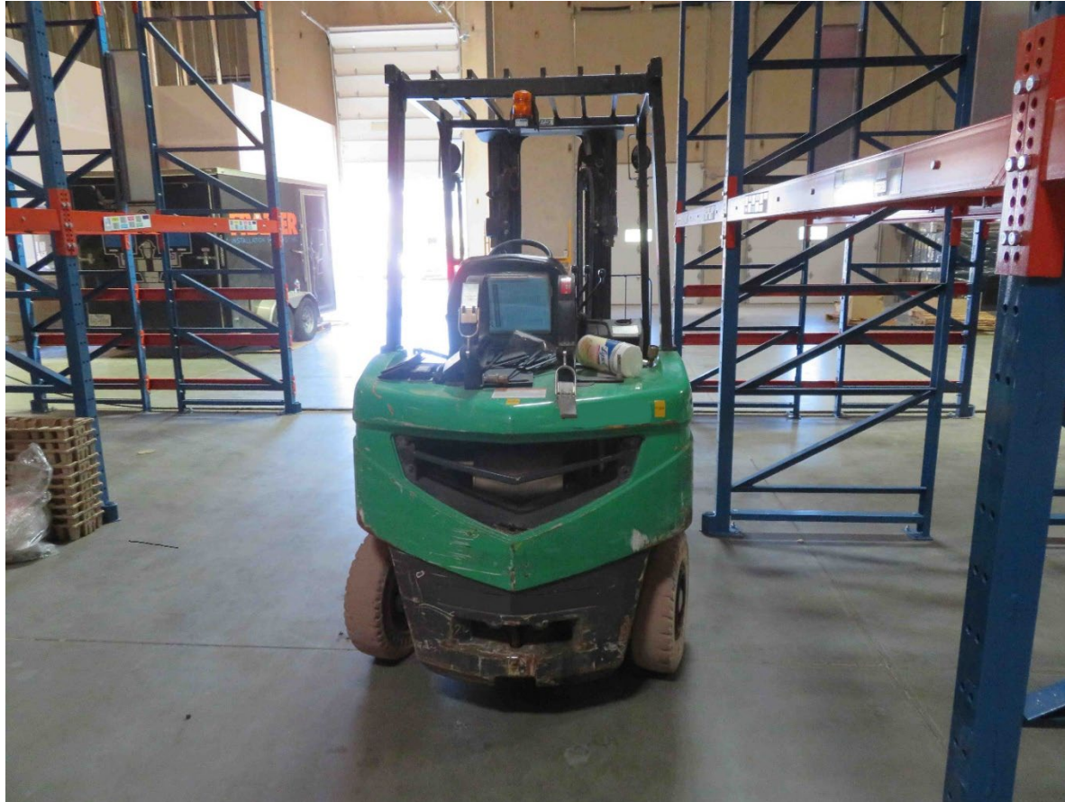
Photo 1. Rear side of forklift that struck and crushed the operator against one of the metal uprights.