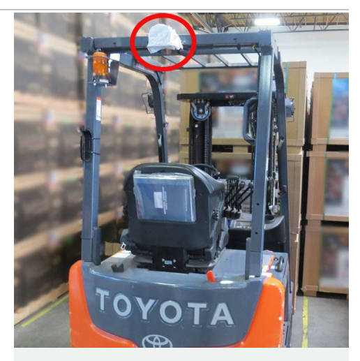
Figure 1: The employer placed white material and tape around the back-up alarm to reduce noise in the warehouse (red circle).

In the space below, list some of the factors that you think could have contributed to this incident. Then, flip the page over for contributing factors and safety recommendations and requirements.