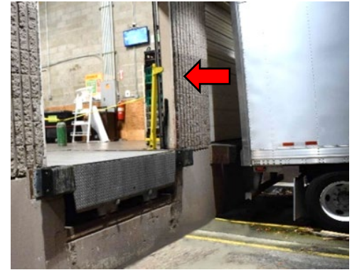
Arrow shows where the clerk was leaning out when the trailer lurched back and crushed him.

Fatal Facts: How to Prevent Loading and Unloading Incidents . WA FACE program