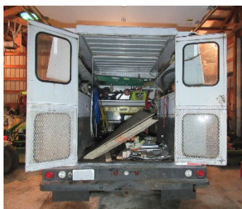
Rear view of truck cargo area.

Caught in or between / Building materials